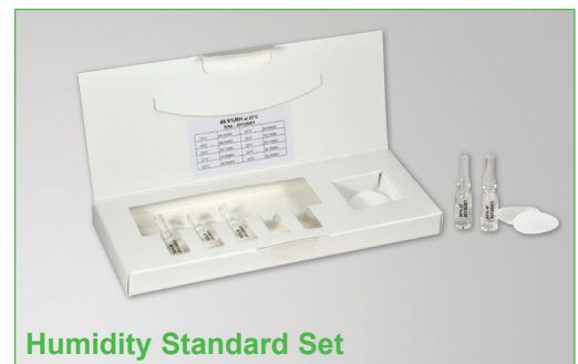
Humidity Standard Set